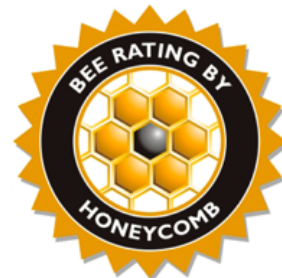
Verification Manager Honeycomb BEE Ratings